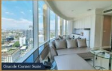
Grande Corner Suite